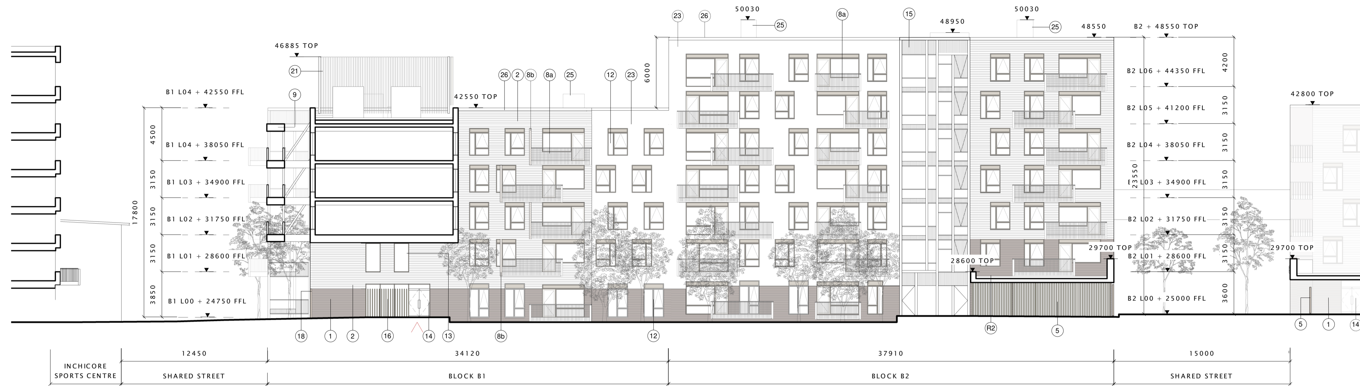
1 Main Residential Courtyard Elevation - East 1/2 1 : 200