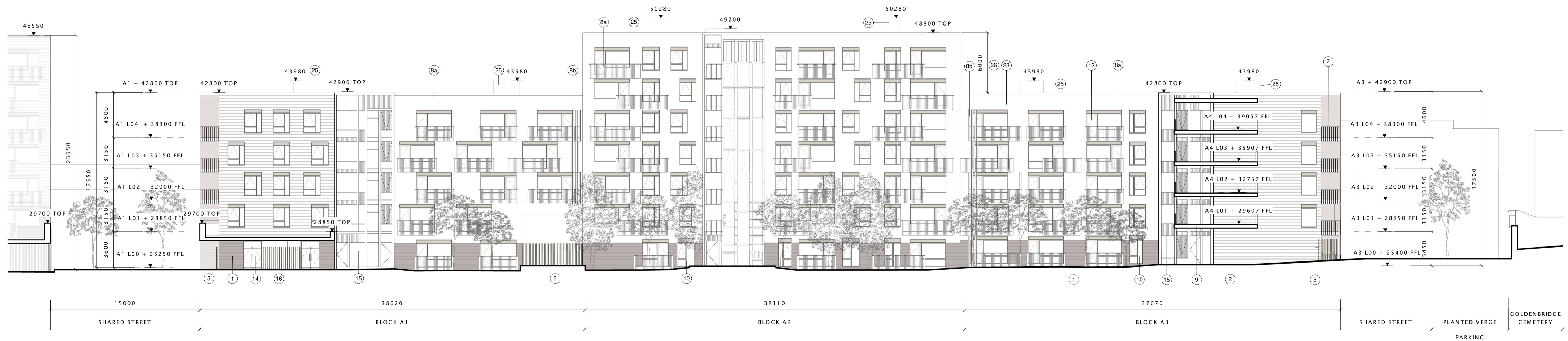
2 Main Residential Courtyard Elevation - East 2/2 1 : 200